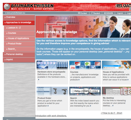
Figure 1: Different access ways to knowledge with the RELOAD-platform.

As an answer to the crucial need of active learning, we realized different learning approaches within the new system architecture, to make intuitive execution of learning activities for different kinds of learners possible. The knowledge platform now contains an encyclopaedia, short Microtraining courses, a 3-D house of applications, a product finder and a search engine. Furthermore, users are able to personalize the system by using a personal desktop (see figure 1).